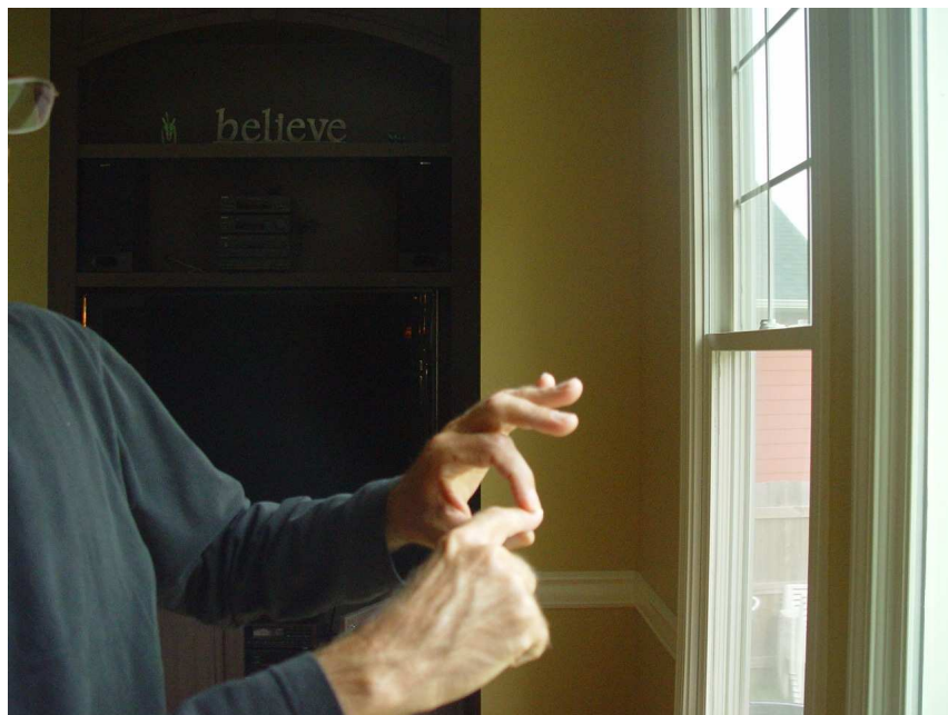
A weak response-finger breaks the circle