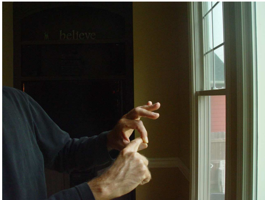
A strong response - finger cannot break the circle