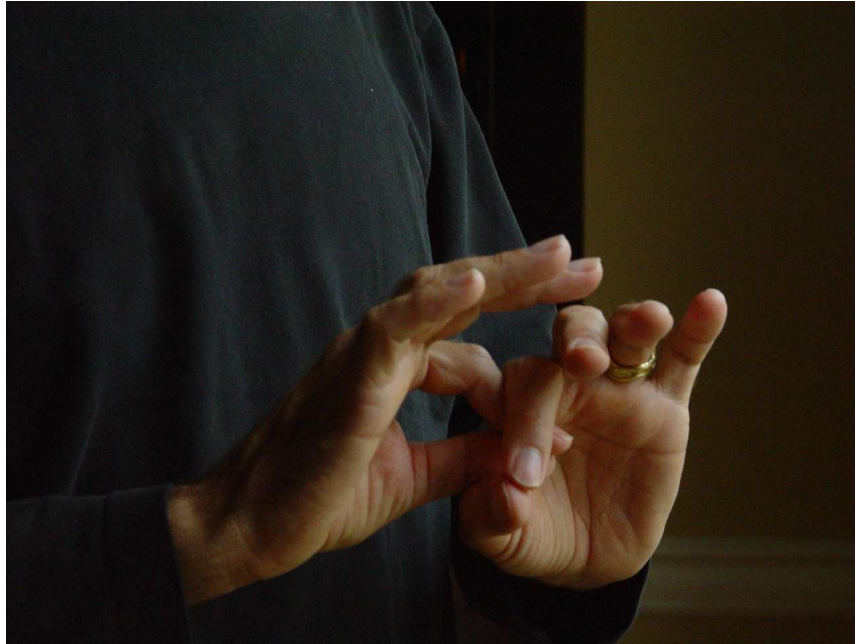
A strong response - unable to open circle